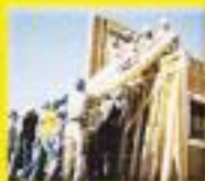
Habitat for Humanity