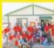
Homes of Hope