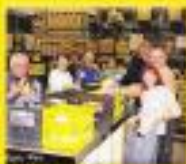
Calgary Food Bank